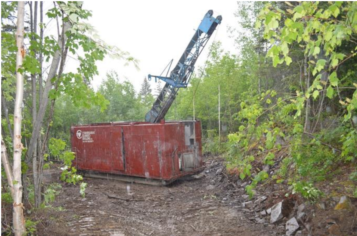
Figure 1: CDD enclosed skid-mounted diamond drilling rig set up on site ZA-20-01