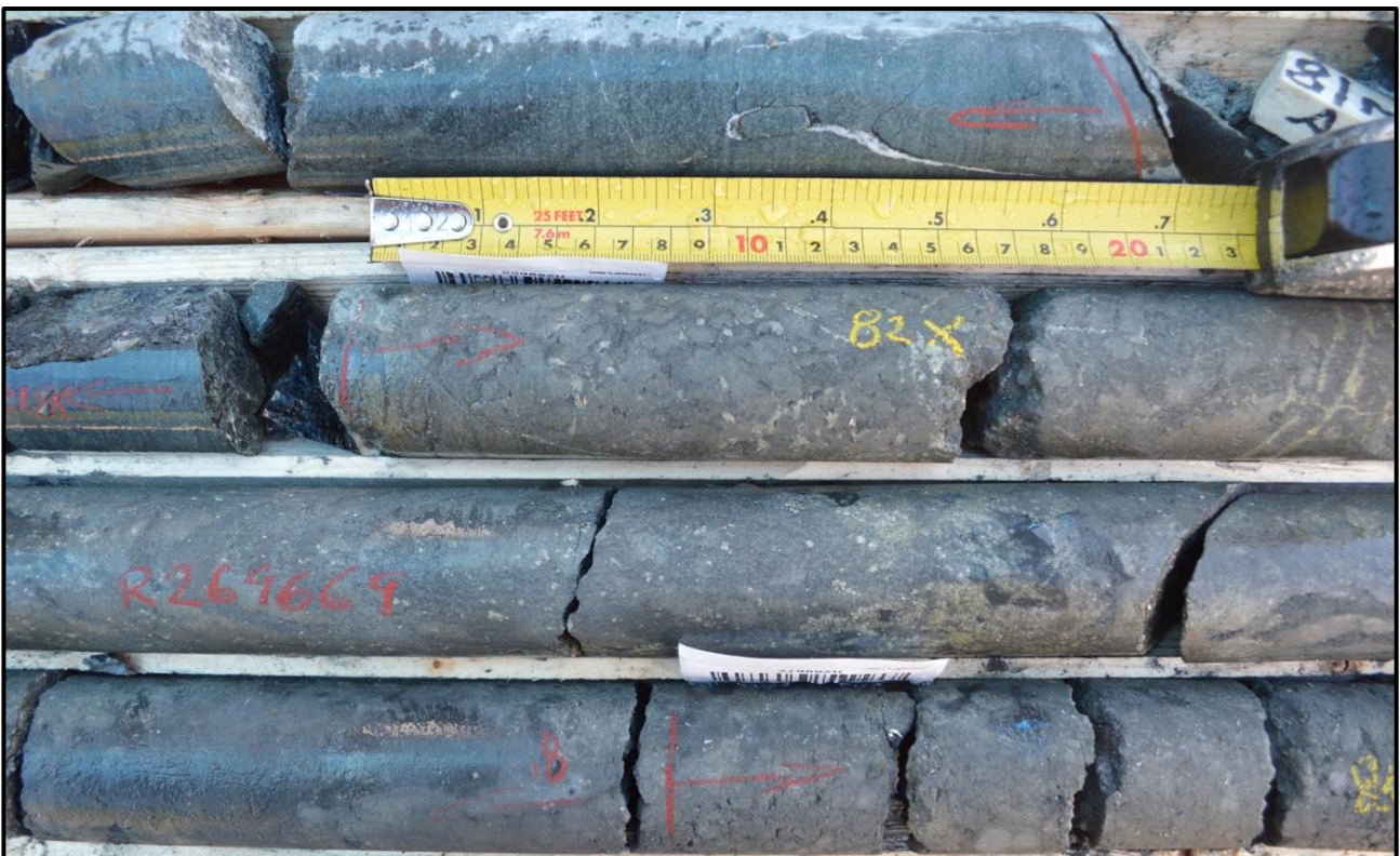
Figure 2: ZA-20-05. Massive sulphide from 81.85m downhole