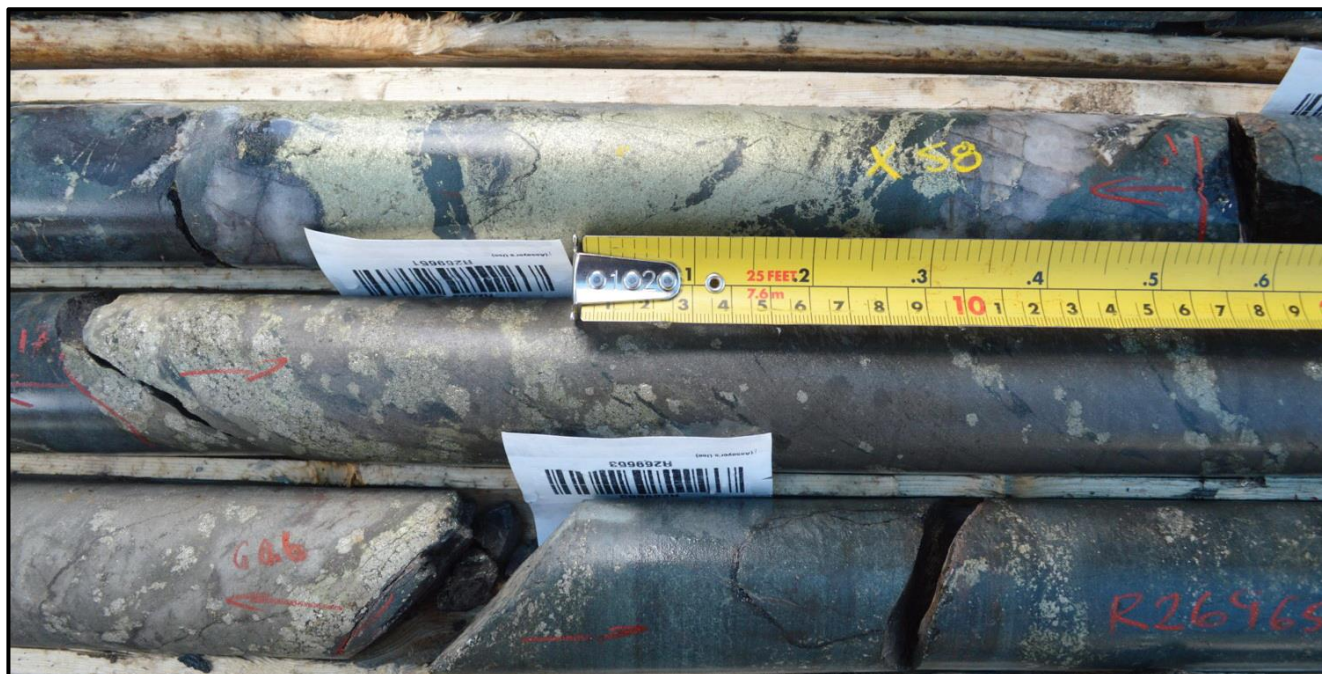
Figure 1: ZA-20-05. Massive chalcopyrite at 57.8m and massive sulphide (pyrrhotite + pyrite) at 59.2m downhole with net textured mineralisation to 62.3m downhole.