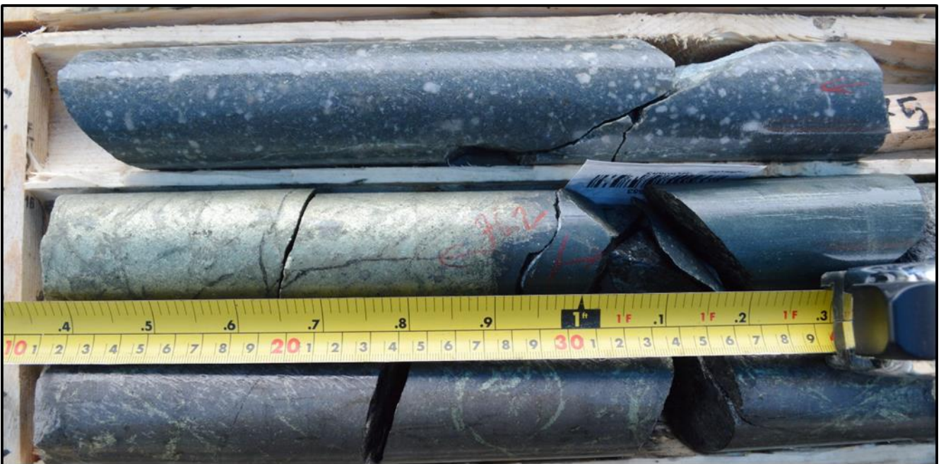
Figure 2: ZA-20-01. Speckled feldspar porphyry with 25cm massive chalcopyrite mineralisation from 75.95m.