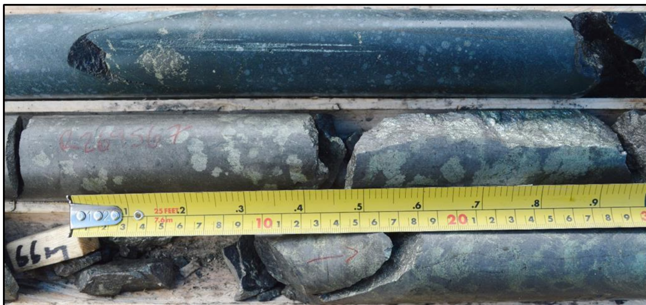
Figure 1: ZA-20-01. Porphyry contact zone - massive pyrrhotite with coarse pyrite blebs and disseminated chalcopyrite from 63.7 to 67.0m downhole.