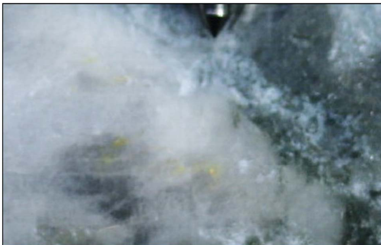
Figure 1: Very fine grained gold on vein margin at ~462m downhole. Note the scribe point for scale.